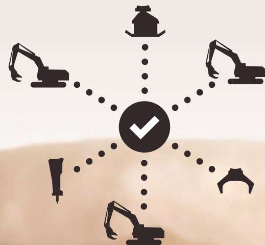
A clean, homogeneous system